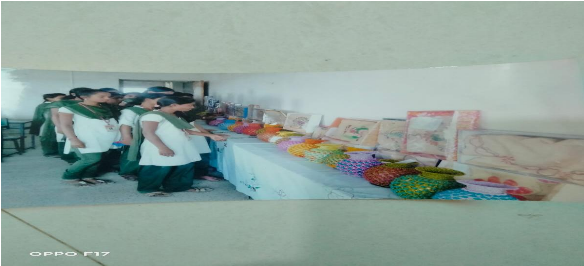
Artwork created by students of the Home Economics