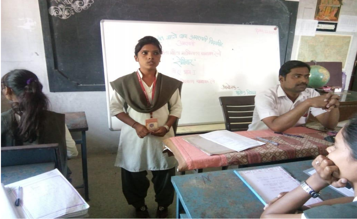
Department of Geography organised seminar for the students.