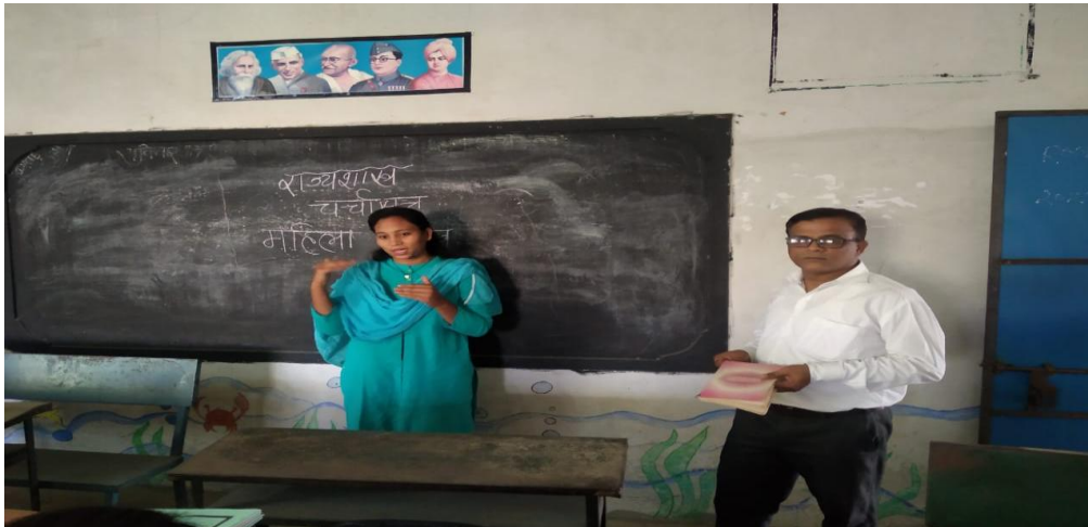
Department of Political Science organised seminar for the students

Various departments organise special programs for the students. Both the advanced and slow learners students participated in the programs where the advanced learners were in the forefront and the slow learners assisted them.