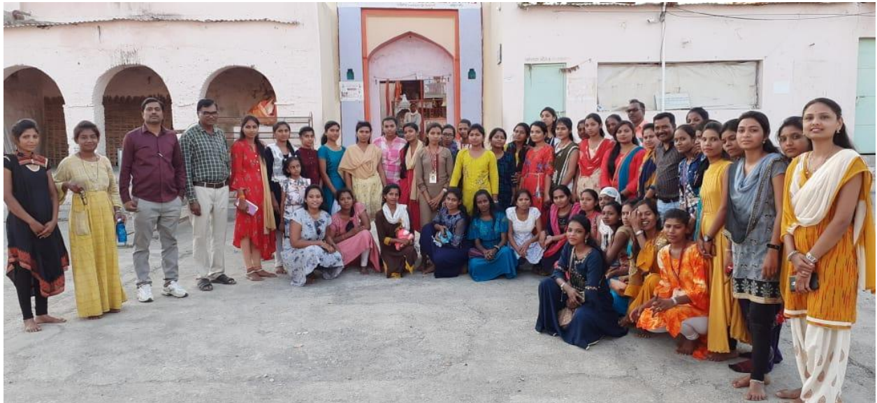
Study Tour at Salbardi Nerpingalai to enhance knowledge and learning experience of the students