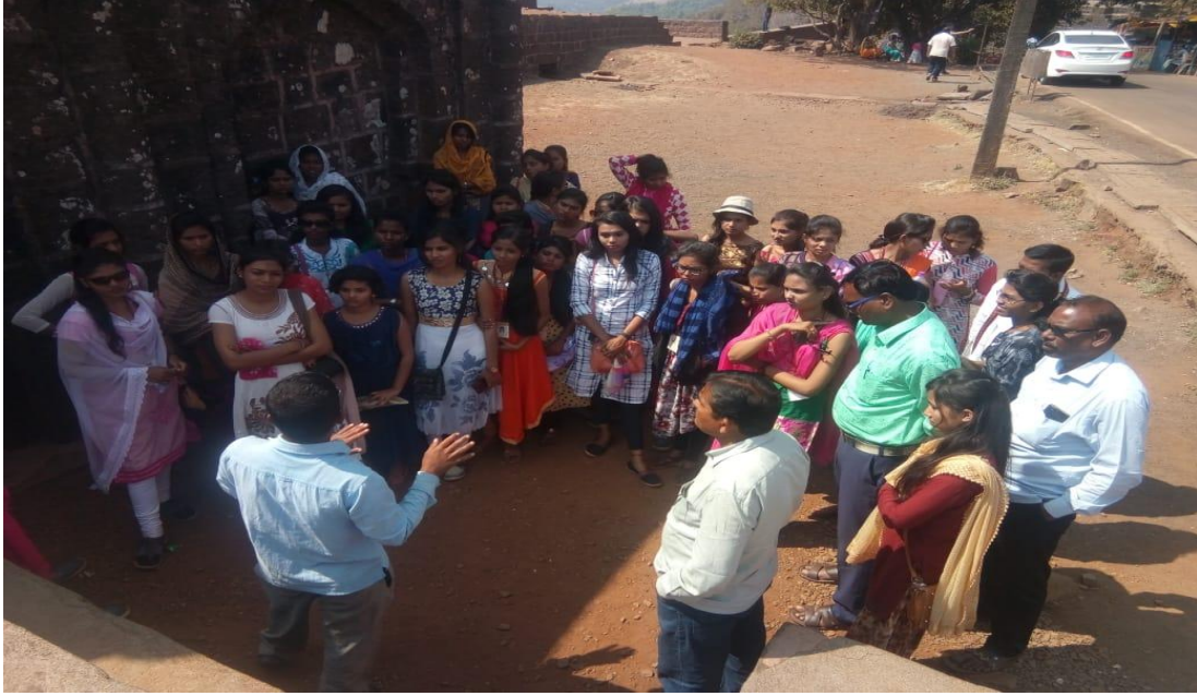
Study Tour Mumbai, Ratnagiri and Kolhapur from department of Geography