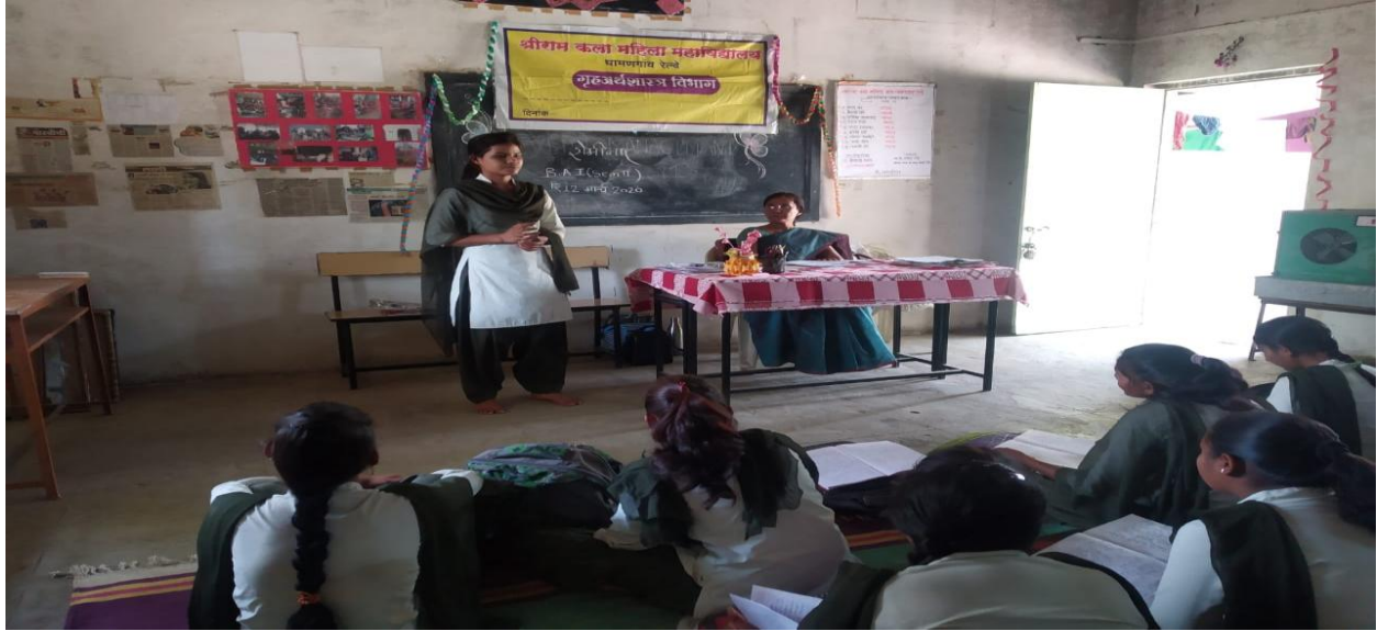
Department of Home Economics organised the seminar for the students