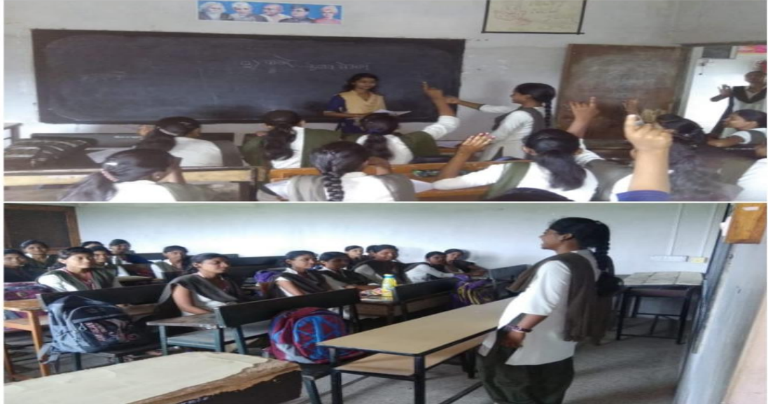
Question answering session by the students of political Science