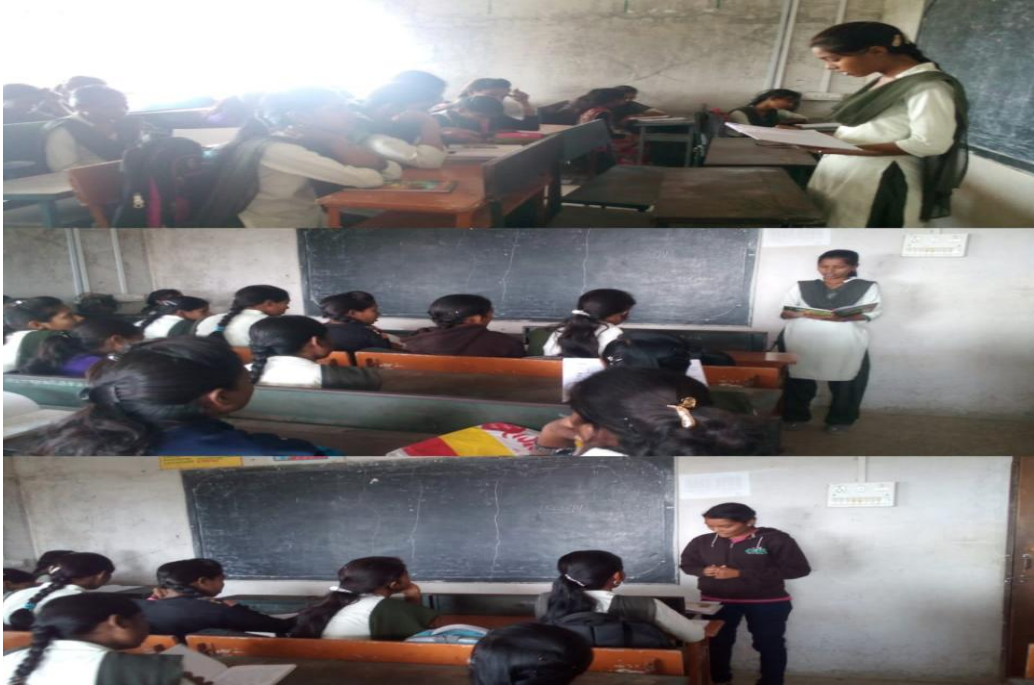
Department of Political Science organised Seminar