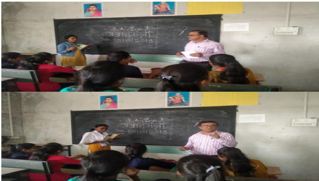
Seminar Presentation organised by Department of Political Science