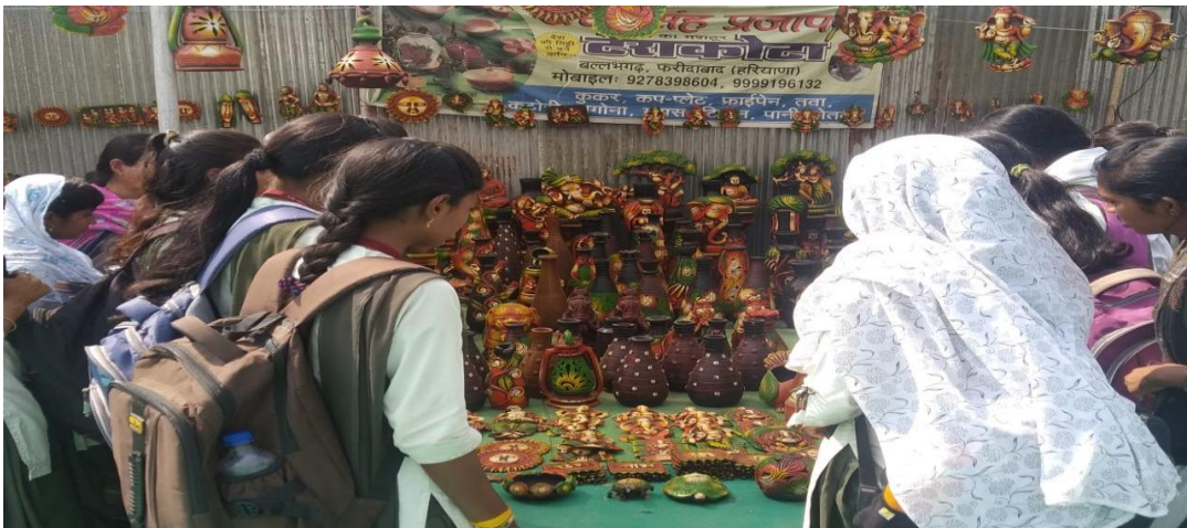
Department of Home Economics Organised the tour to visit the handicraft exhibition