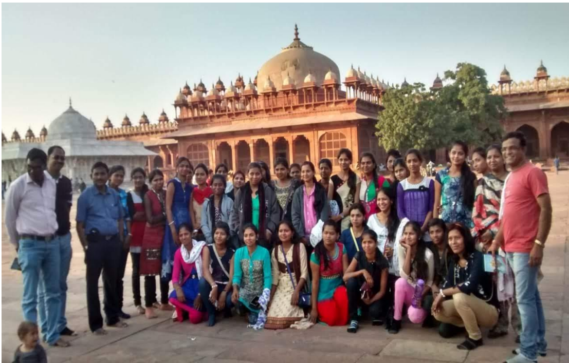
Study Tour by Department of Geography