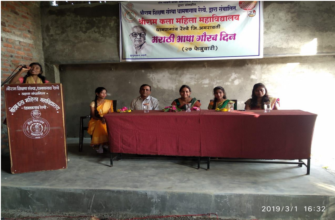
Department of Marathi organised Marathi Bhasha Din