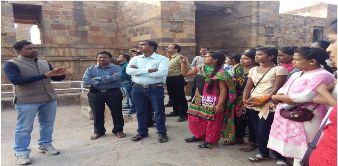
Study Tour by Department of Geography

श्रीराम कला महिला महाविद्यालय, धामगगावर ताल्ले त्रि. अमरावती. भौगोलिक घटक 2017-18