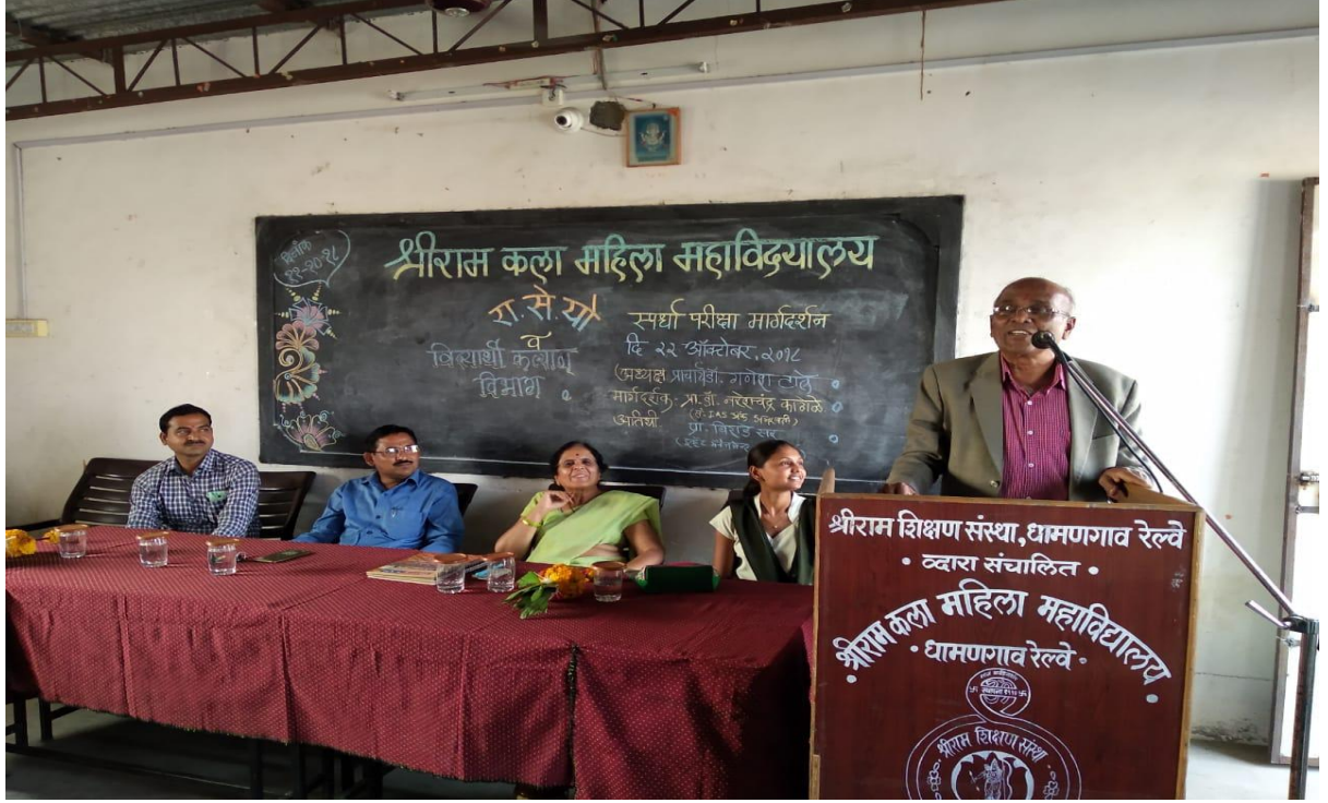
Program on Guidance on Competitive Exam by Department of Marathi