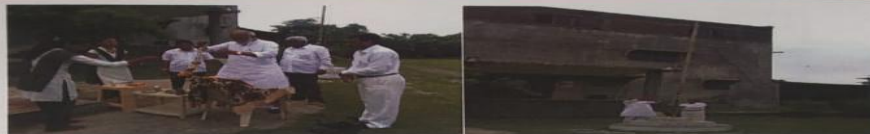
Flag Hosting Ceremony