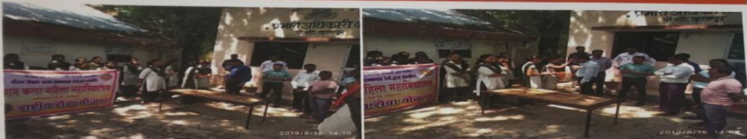
Rakshabandhan Celebrated at Dattapur Police Station Dhamangaon Rly