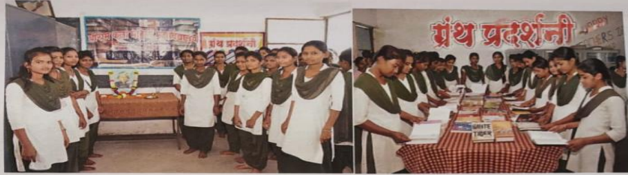
Book exhibition on the occasion of Dr. A. P. J. Abdul Kalam's Birth Anniversary on Dt. 16/10/2019.