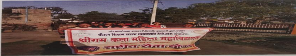
Save Environment Rally