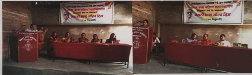
Marathi Bhasha Din