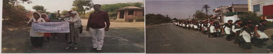
Global Warming Rally