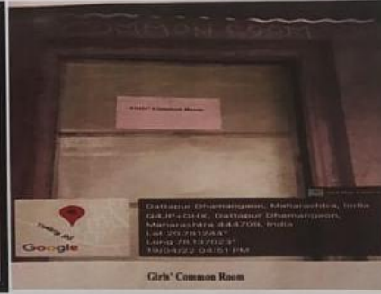
Girls' Common Room