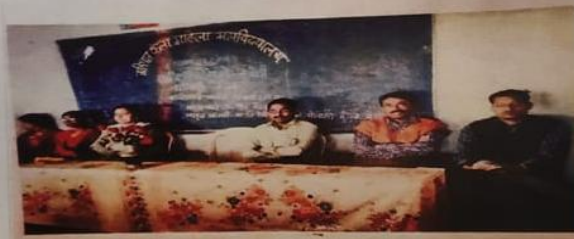
Program on occasion of the Birth Anniversary of Reverend Savitribai Fule